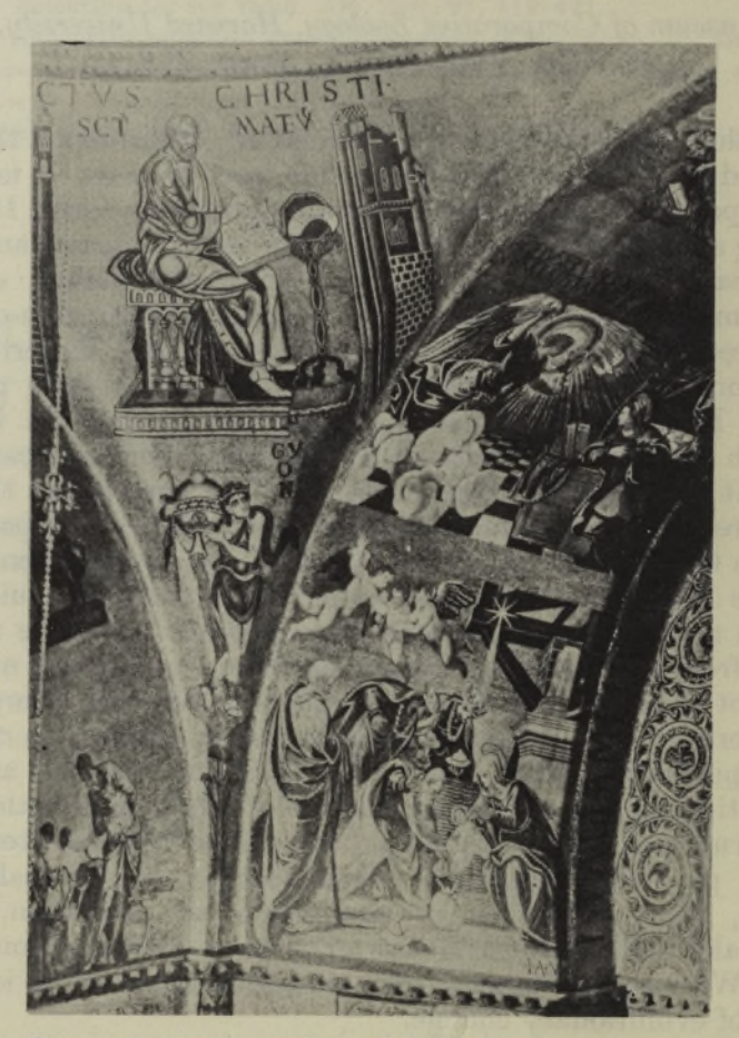
FIGURE 1. One of the four spandrels of St Mark's; seated evangelist above, personification of river below.

The design is so elaborate, harmonious and purposeful that we are tempted to view it as the starting point of any analysis, as the cause in some sense of the surrounding architecture. But this would invert the proper path of analysis. The