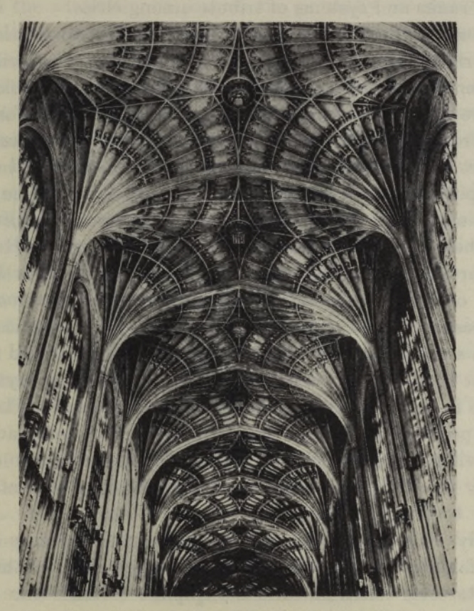
FIGURE 2. The ceiling of King's College Chapel.

the Tudor rose and portcullis. In a sense, this design represents an 'adaptation', but the architectural constraint is clearly primary. The spaces arise as a necessary by-product of fan vaulting; their appropriate use is a secondary effect. Anyone who tried to argue that the structure exists because the alternation of rose and portcullis makes so much sense in a Tudor chapel would be inviting the same ridicule that Voltaire heaped on Dr Pangloss: 'Things cannot be other than they